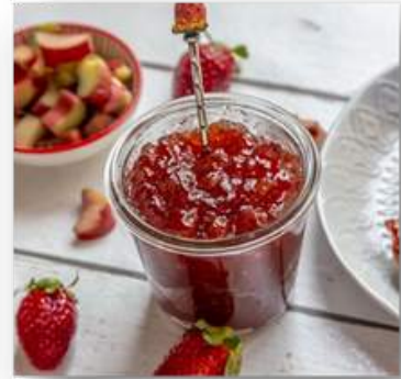
Jam & Jelly Making