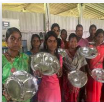
Paper plates, Bowls