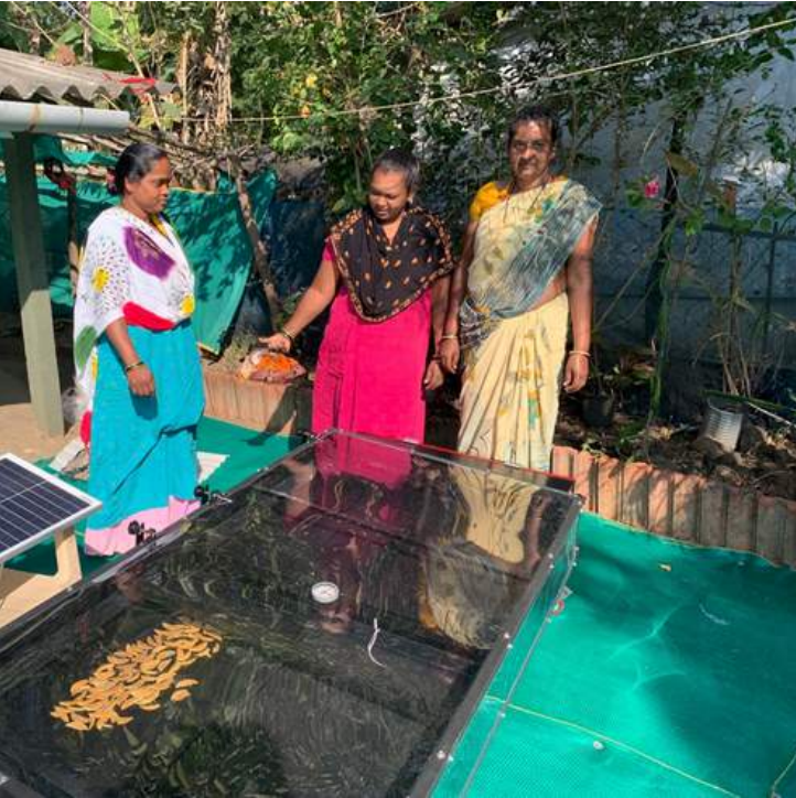
Parvati Mahila Bachat Gath, Vill. Rampur, Tal. Dahanu