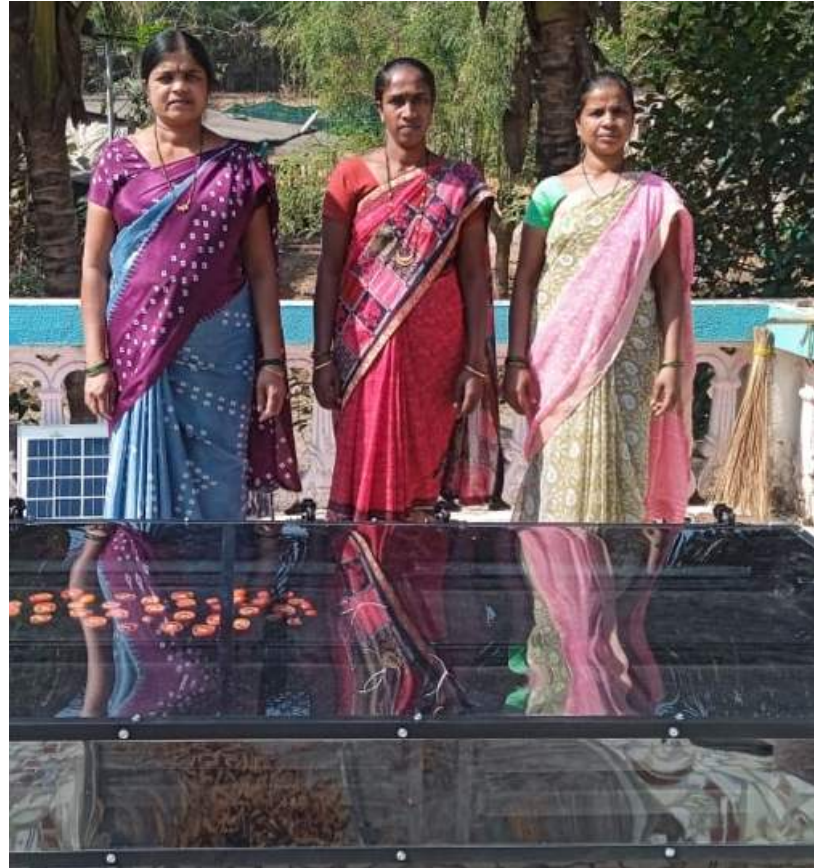
Sai Samarth Mahila Bachat Gath. Vill. Kosbad, Tal. Dahanu