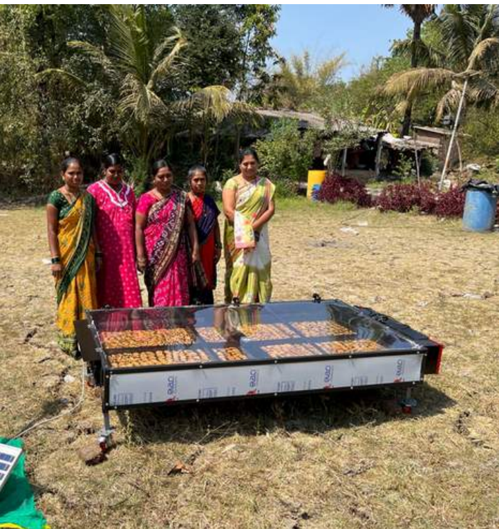
Divyani Mahila Bachat Gath, Vill. Bawda, Tal. Dahanu