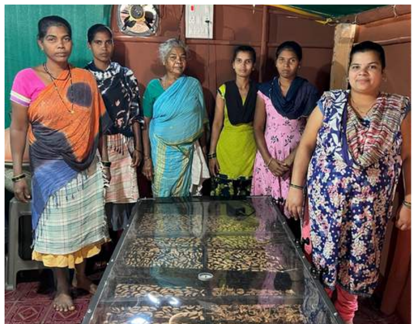
Santoshi Swayam Sahayta Samuha, Vill. Gholvad, Tal. Dahanu