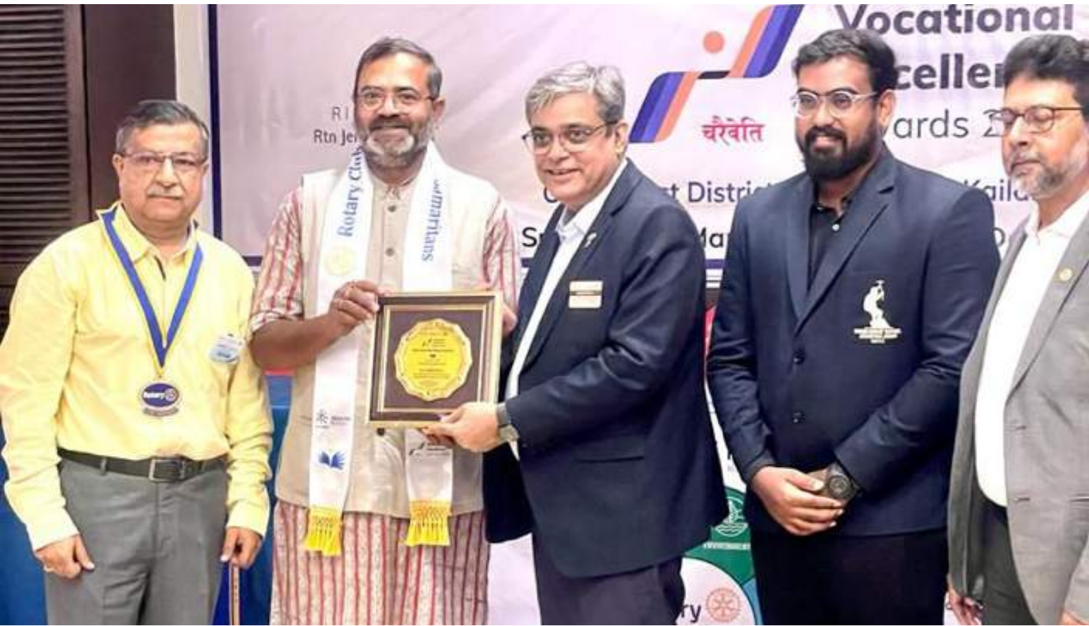
Received the Vocational Excellence Award from the Rotary Club of Navi Mumbai Samaritans in Palghar district