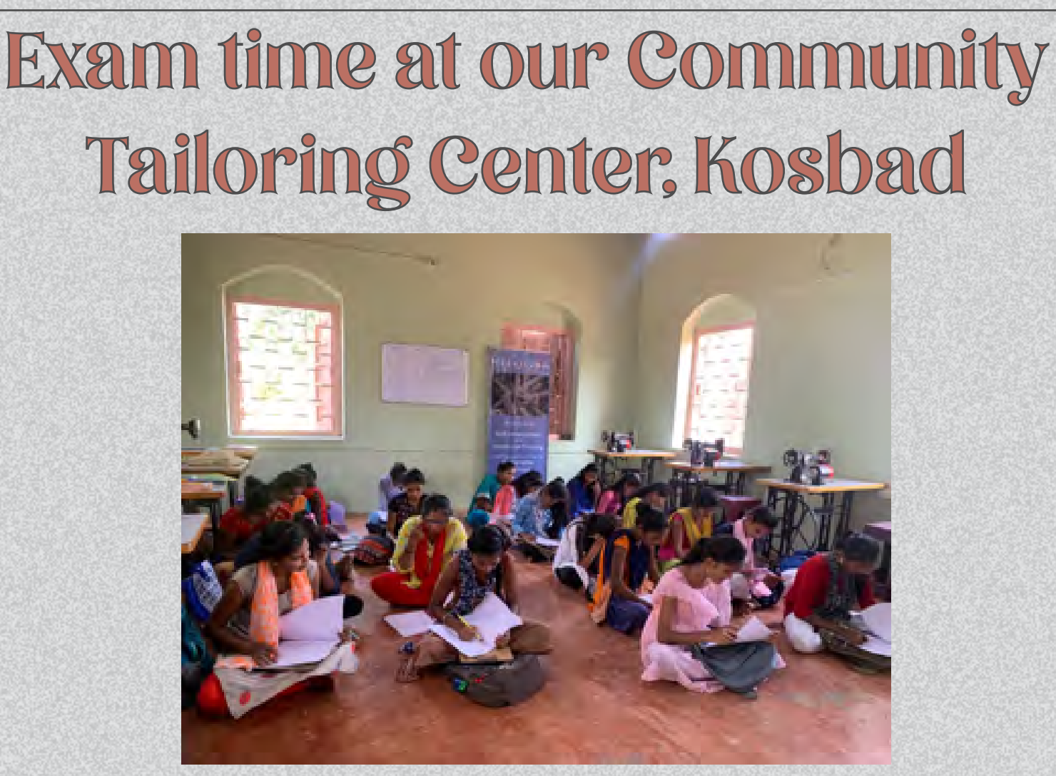
Students of Batch 2 & 3 taking their exams at our Community Tailoring Center in Kosbad

Women from all the villages covered by us till date - Ganjad, Dhabon, Modgaon, Veti, Rampur and Ambesari attended the program.