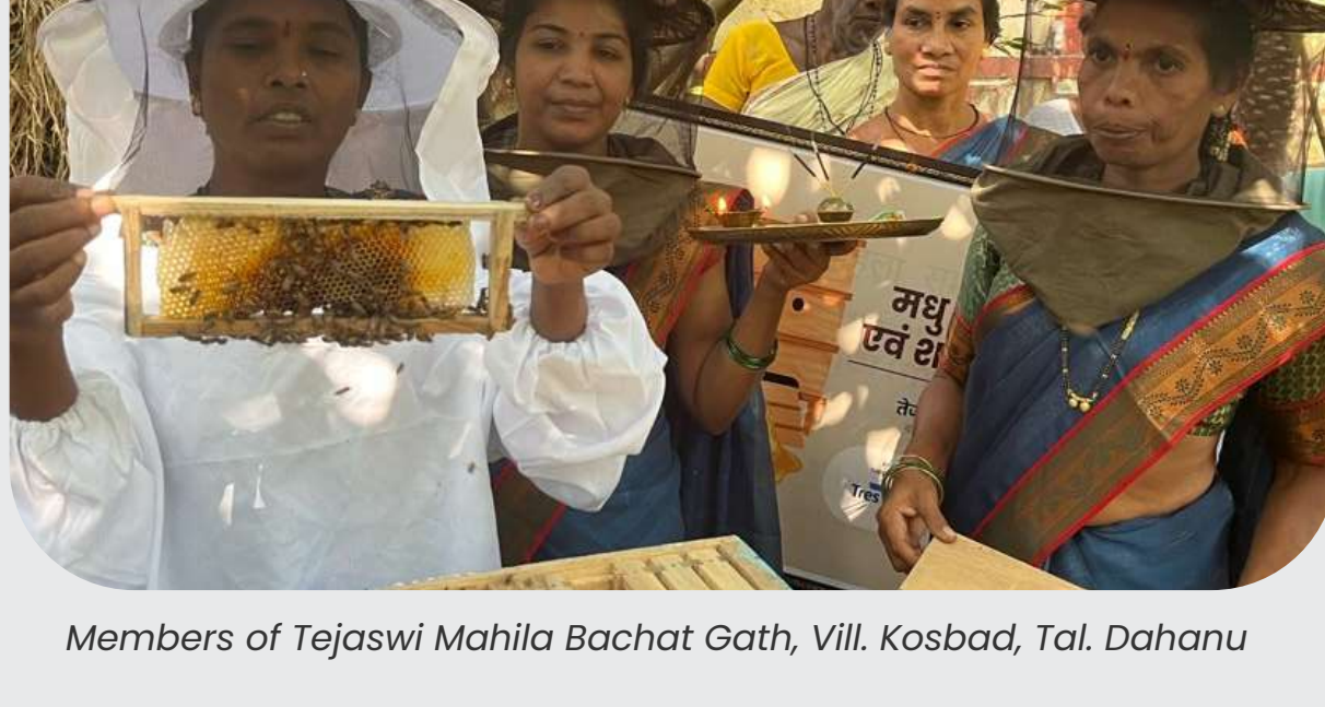
Members of Tejaswini Mahila Bachat Gath, Vill. Kosbad, Tal. Dahanu