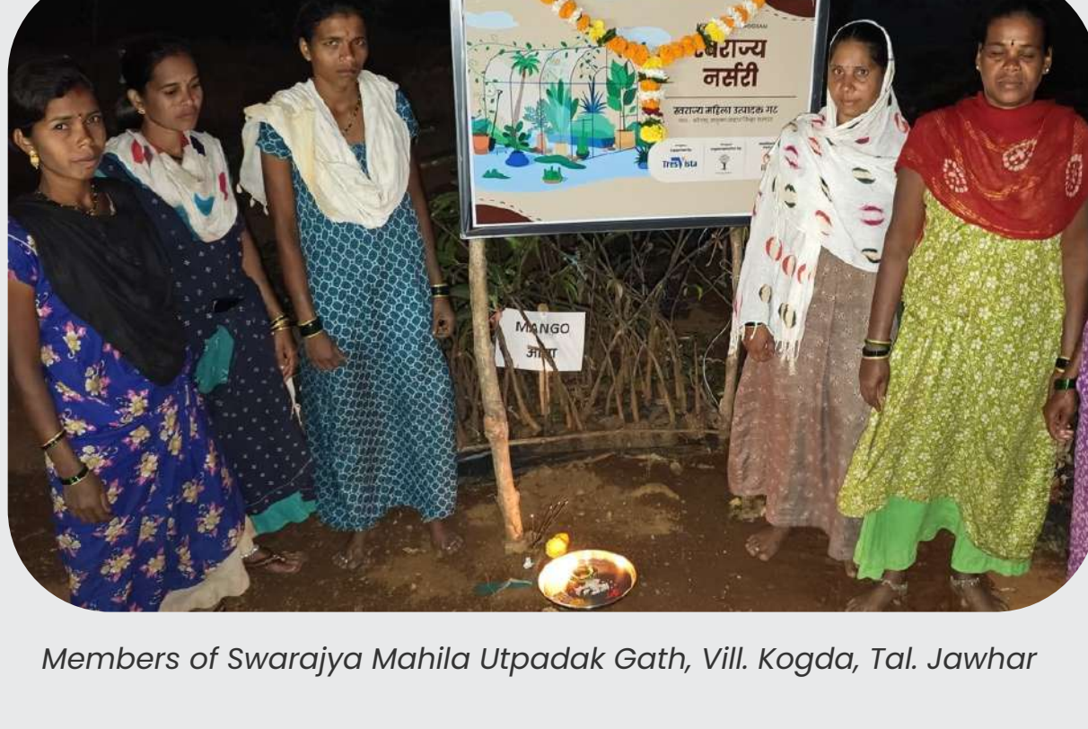
Members of Swarajya Mahila Utpadak Gath, Vill. Kogda, Tal. Jawhar