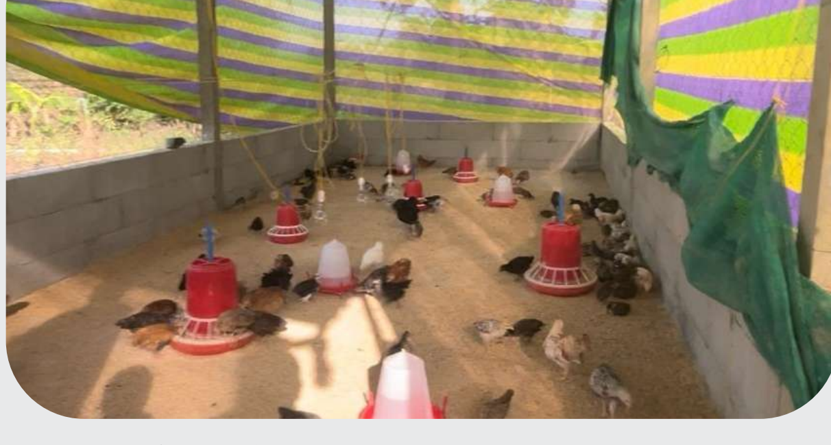
Members of Devyani Mahila Bachat Gath, Vill. Modgaon, Tal. Dahanu