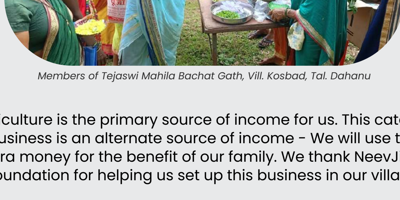
Members of Tejaswini Mahila Bachat Gath, Vill. Kosbad, Tal. Dahanu

Agriculture is the primary source of income for us. This catering business is an alternate source of income – We will use this extra money for the benefit of our family. We thank NeevJivan Foundation for helping us set up this business in our village.