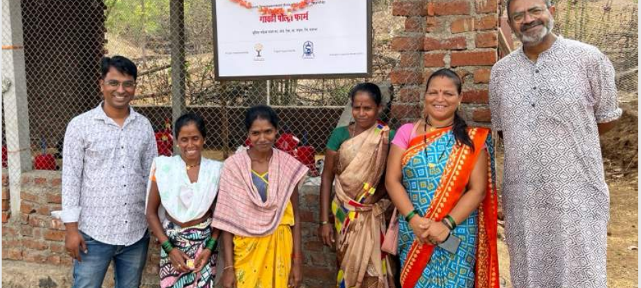
Bhumika Mahila Bachat Gath, Aina

Poultry farming with desi chicken is a vocation that is slowly fading away from the rural landscape because of the following reasons –