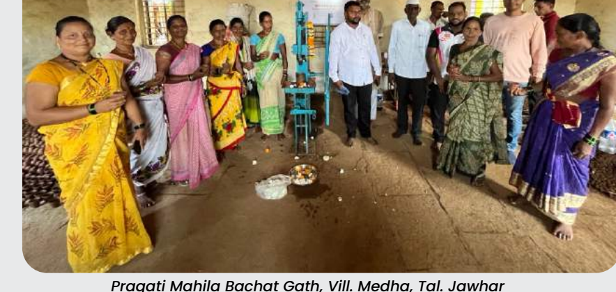
Pragati Mahila Bachat Gath, Vill. Medha, Tal. Jawhar

Making clay cups is another eco friendly and sustainable business that we are supporting in Jawhar – 2 SHGs, namely Pragati Mahila Bachat Gat and Sanjivani Mahila Bachat Gath have started micro business to make clay cups in their villages Medha and Jhaap respectively.