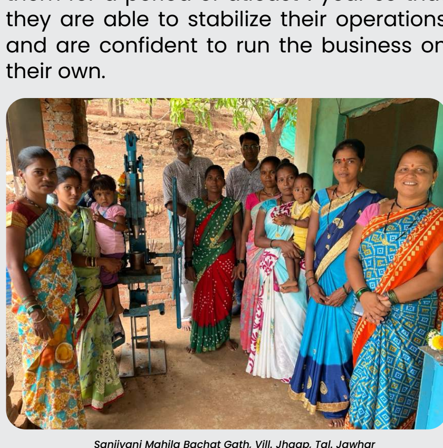
Sanjivani Mahila Bachat Gath, Vill. Jhaap, Tal. Jawhar

We helped them in procurement of the clay cup making machine & dies from a vendor in Rajkot and set up the shop floor. Raw material, i.e. soil is available freely anyways.