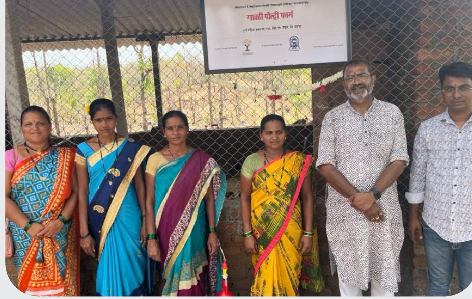
Durga Mahila Bachat Gath, Medha

The women were helped with the design of the shed, setting up the poultry farm and