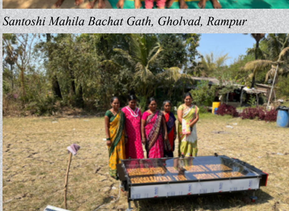
Santoshi Mahila Bachat Gath, Gholvad, Rampur

We are working with 25 SHGs covering over 300 tribal women across these four villages. Watch out for this space for more details on these projects in the next editions of Jivika.