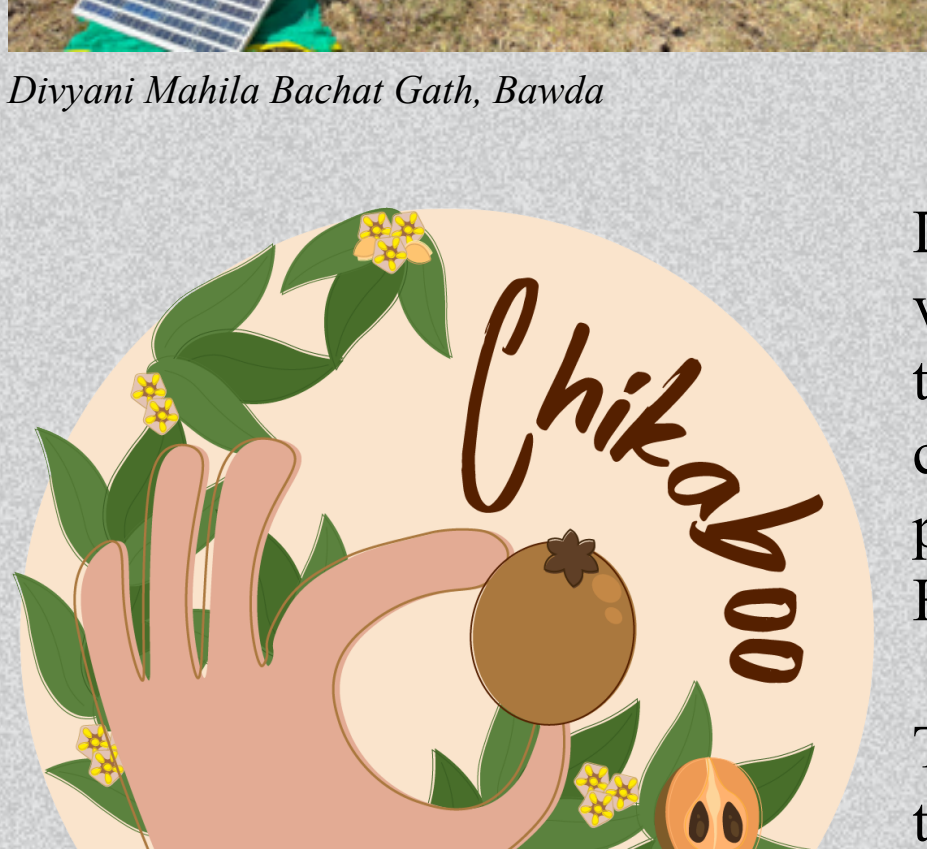
Divyani Mahila Bachat Gath, Bawda