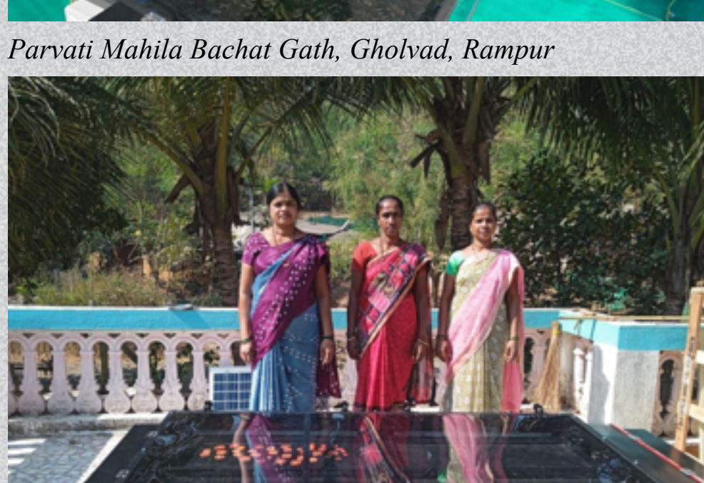
Parvati Mahila Bachat Gath, Gholvad, Rampur