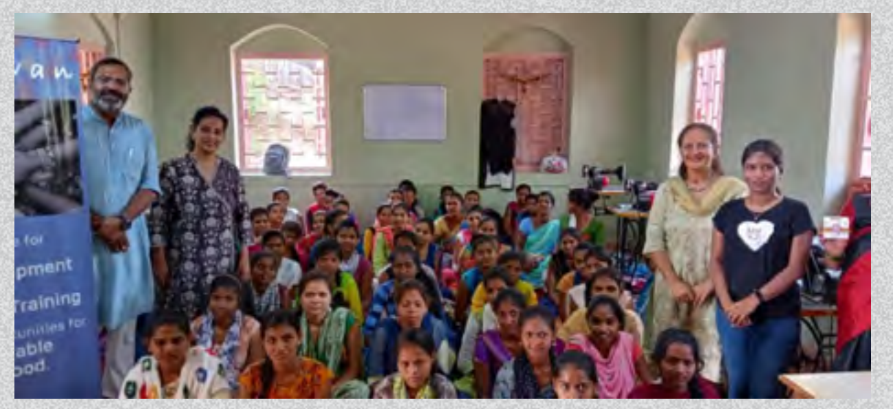
At Kosbad village, Dahanu