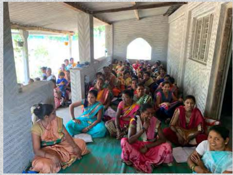
A typical day in the classroom